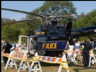
Page 3 HCPD puts its new helicopter on display at the 16th annual Police Pace.