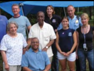
Page 4 National Night Out brought Howard County citizens and police together to fight back against crime.