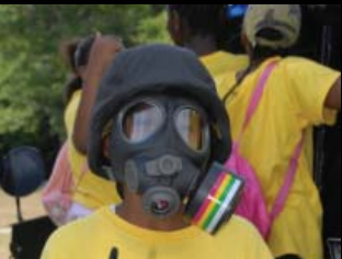
Page 5 Bear Trax participants spend some time breathing in HCPD values.