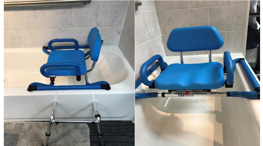
Swivel Tub Seat - Item 21120