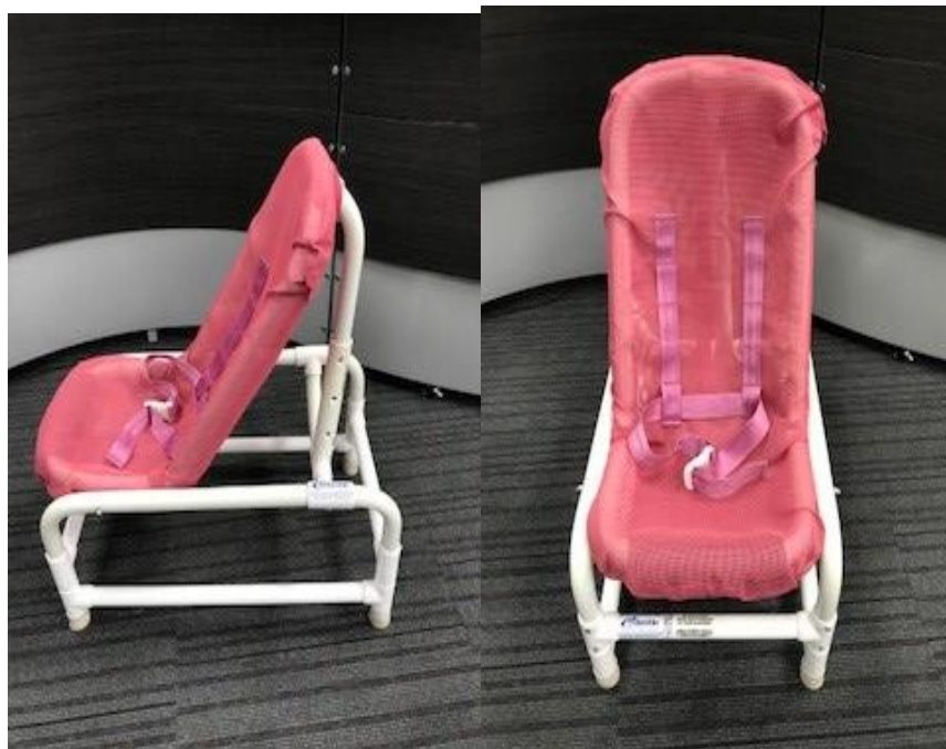
Tilt in space bath chair – Item 23234 (max 100lbs)