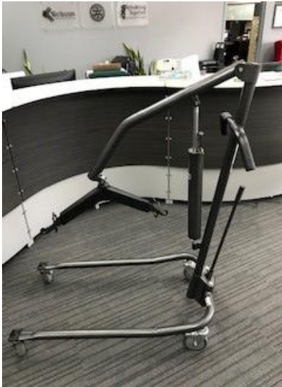
Hoyer Lift - Item 23349