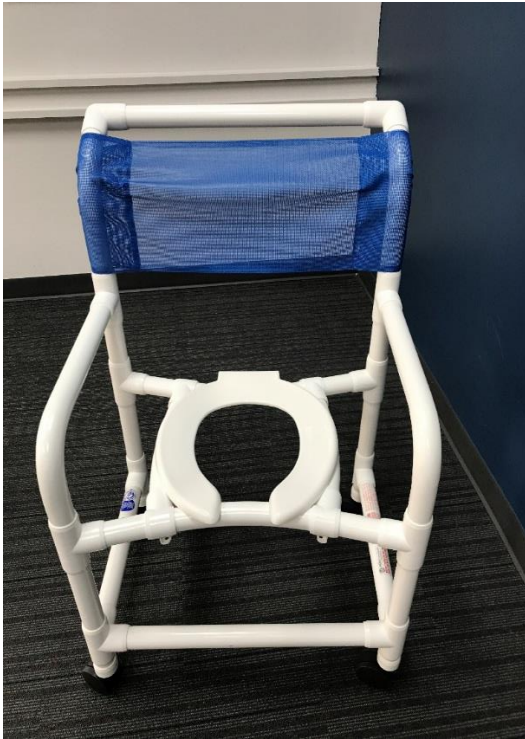
Rolling Shower Commode Chair – Item 22516