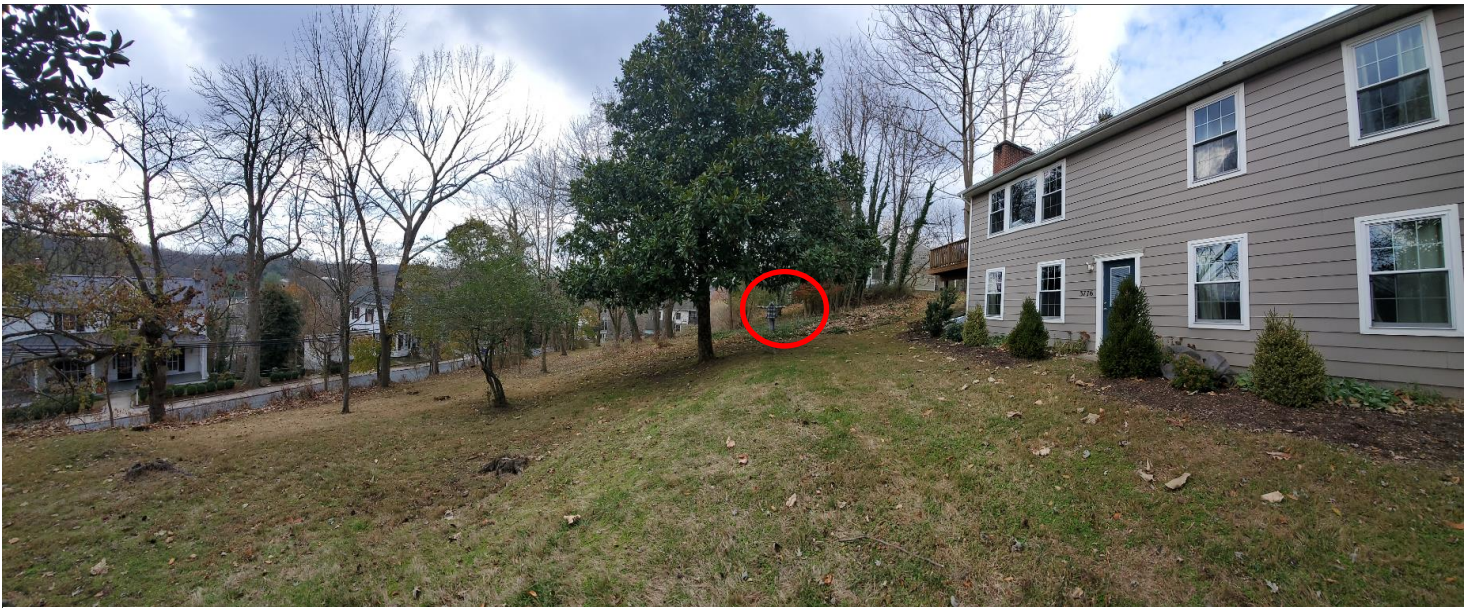
Figure 5 - General location of shed