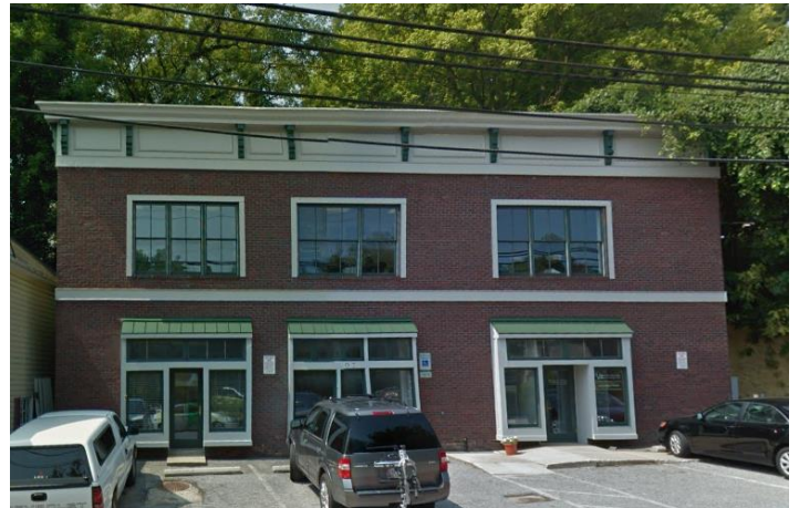
Figure 2 - 2011 photo showing original appearance