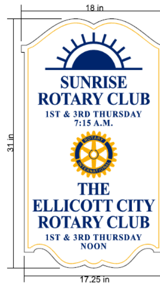
Figure 8 - Current proposed sign