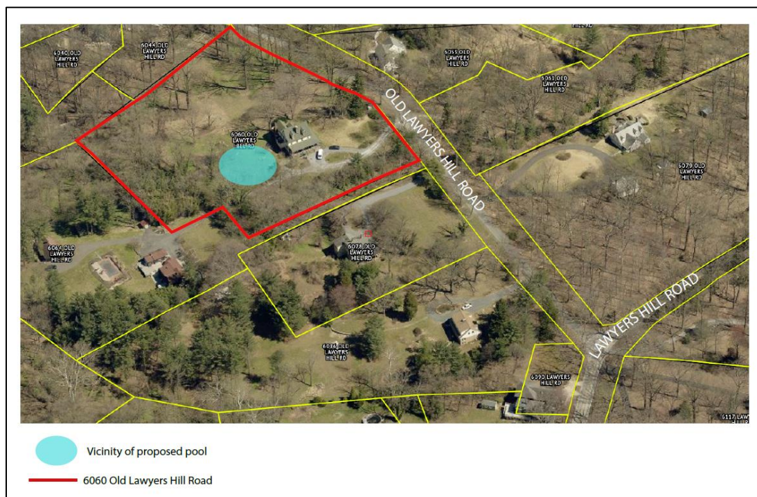
Figure 10 - Map of property and location of proposed pool

The applicant explained that the pool will be located between 23 and 30 feet from the driveway. The final offset is dependent on Health Department guidance, based on the location of the waste line to the septic tank.