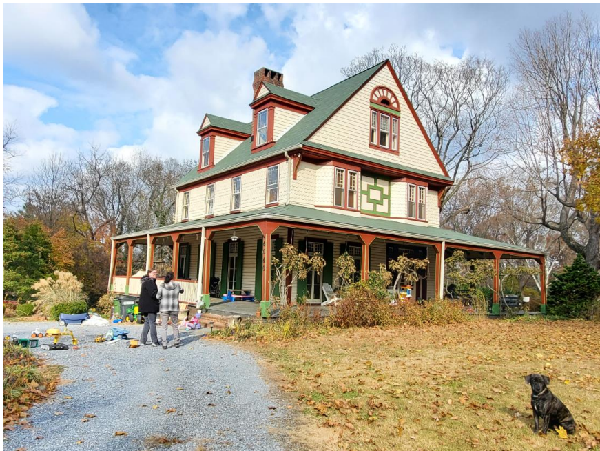
Figure 9 - View of the front and side of the house from driveway.

Request: The applicant, Finn Ramsland, requests a Certificate of Approval to install a pool at 6060 Old Lawyers Hill Road, Elkridge.