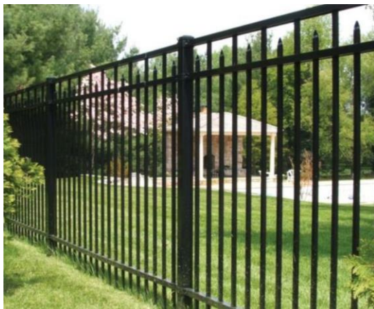
Figure 11 - Antietam style fence