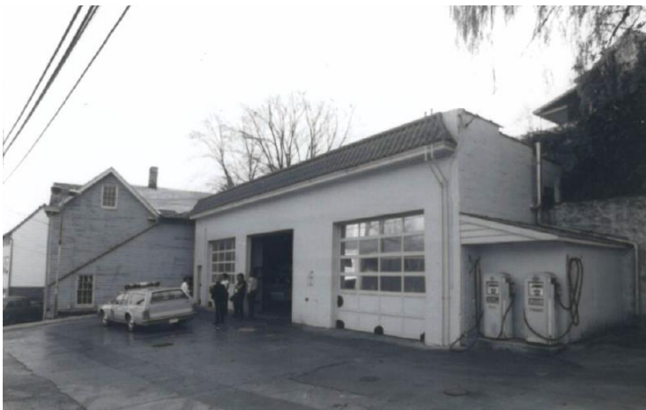
Figure 1 - 1930s era garage/gas station

The renovated building with the second floor has been altered since it’s 1999-2001 construction recently with the painting of the brick and alteration of front doors. The painting and alterations of the doors was approved through the Minor Alterations process (MA-18-13 for the doors and MA-18-20 for the painting) due to the fact that the building was not considered historic.