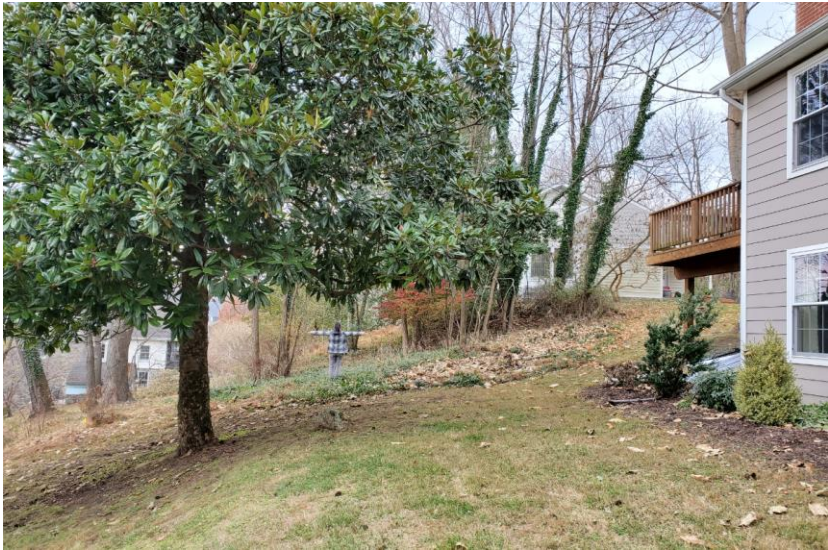
Figure 6 - Closer view of shed location

Staff Recommendation to the HPC: Staff recommends the HPC approve the application as submitted.