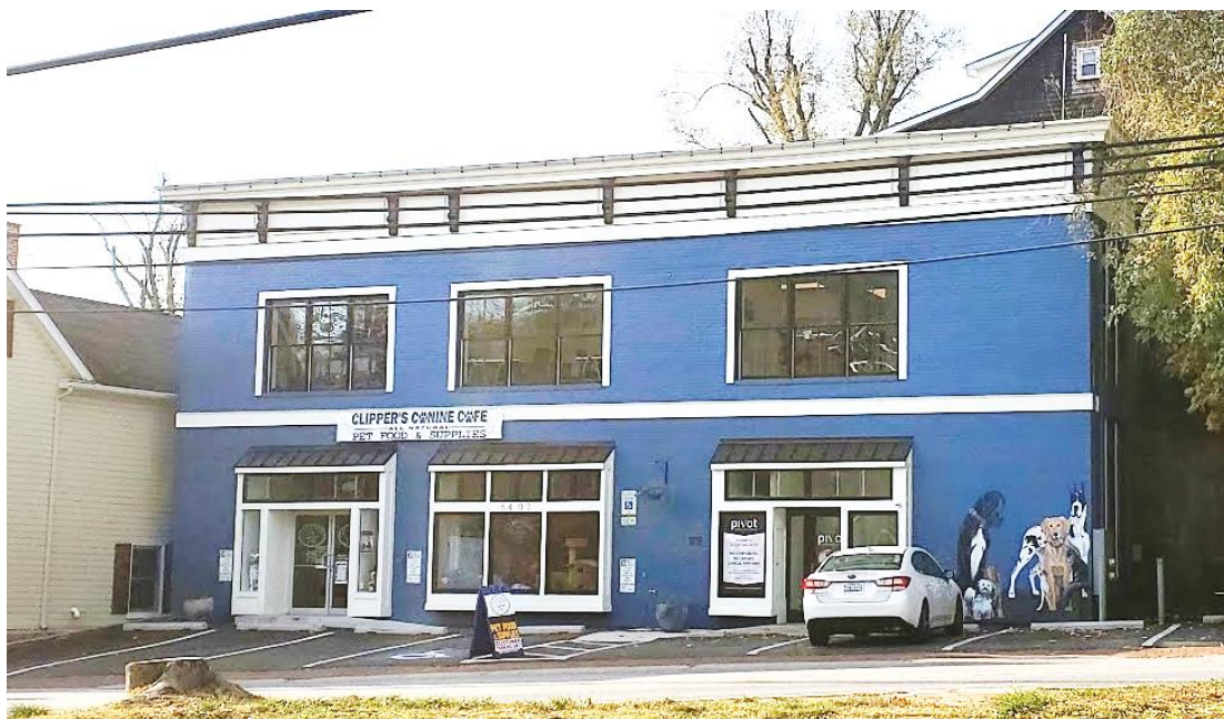
Figure 3 - November 2019 photo showing current appearance of reconfigured door openings, painted brick and unapproved mural