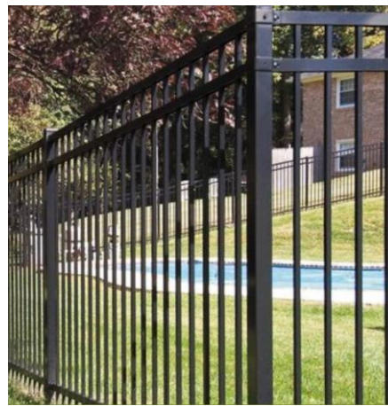
Figure 12 - Hancock style fence

While the guidelines do not recommend use of a wrought iron fence (which this would emulate in style, but is aluminum in material rather than iron), the fence will not be highly visible from the road or neighboring property. The fence will be most visible from the driveway. The fence will be 4 feet high, which is the shortest the fence can be in order to comply with the code requirements for fencing around a pool.