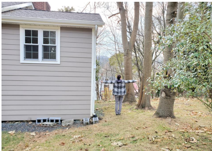
Figure 4 - Distance of trees to house

While the house is not historic, the trees are visibly growing close to the foundation and roofline and pose a threat for damage, especially to the foundation. While the trees do not appear to be in poor health, the proposal does comply with the Guidelines as the trees are too close to the building, and the applicant will replant three trees of a native variety farther away from the house.