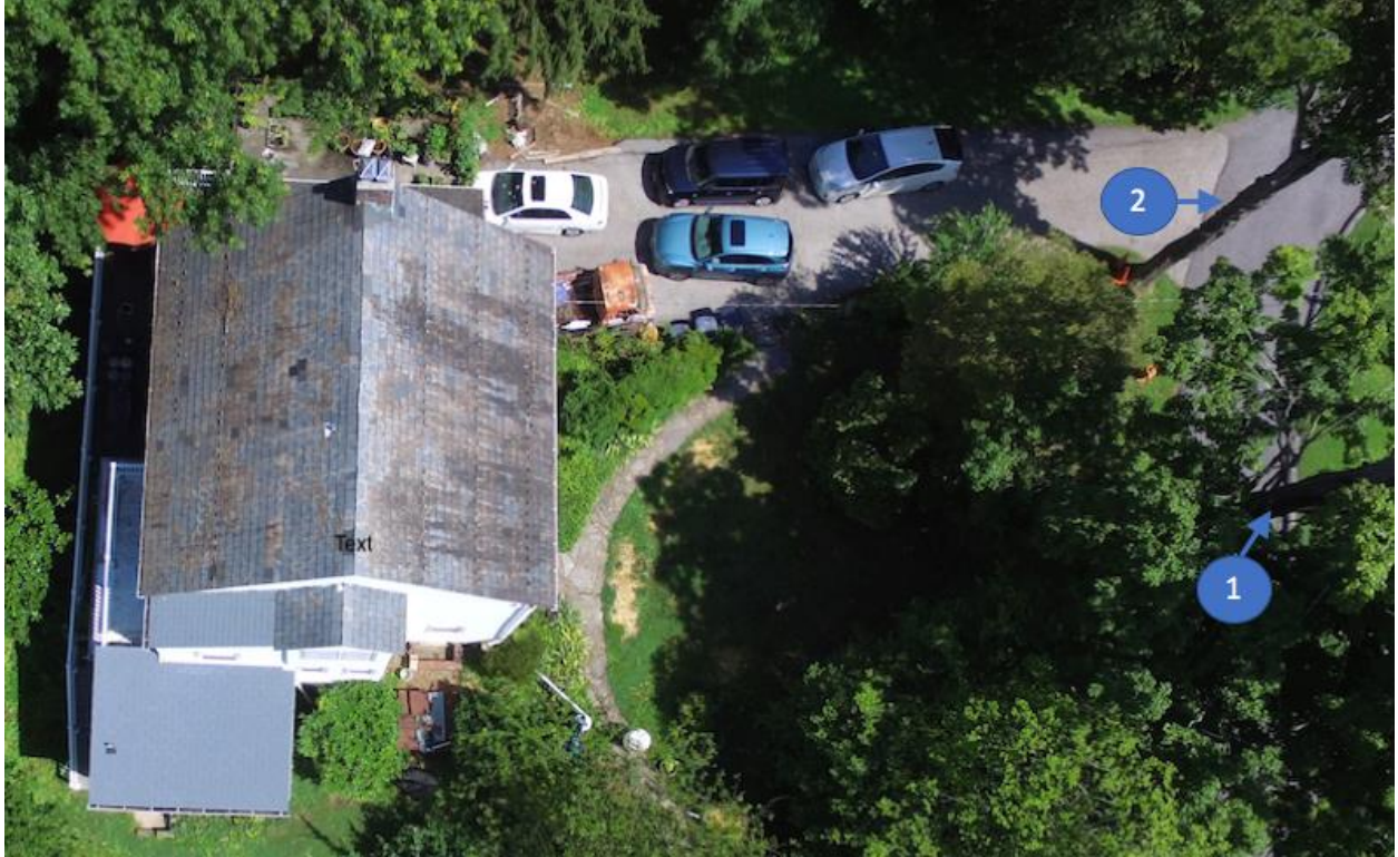
Here is an overhead view of our property. Tree 1 sits just a few feet off the road. Tree 2 sits a few feet from the road and the driveway.