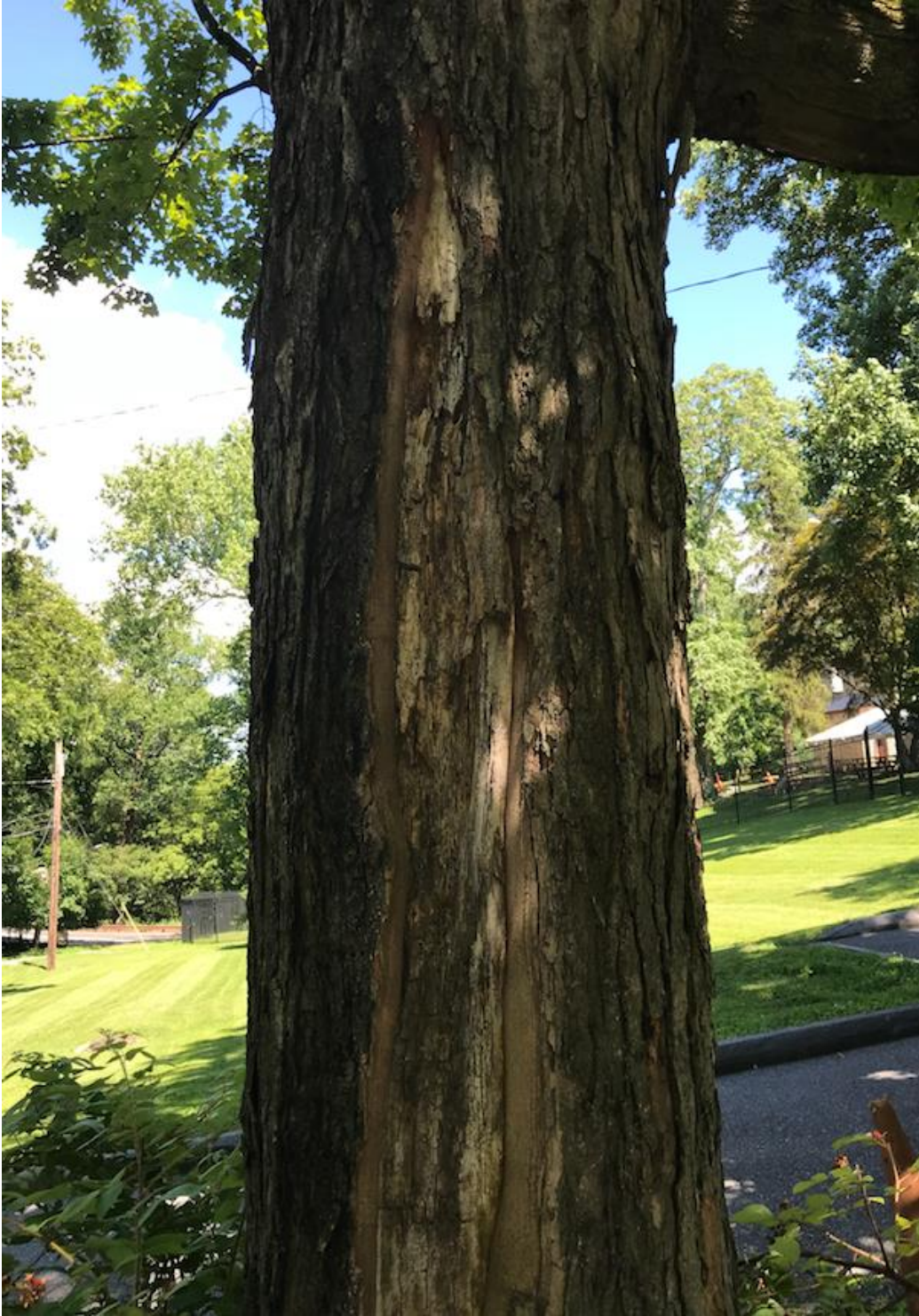
Tree 1 trunk