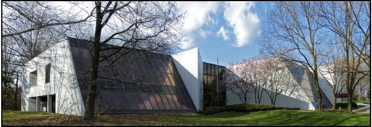
Figure 1: Flier Building viewed from Little Patuxent Parkway

The Flier Building is situated on an approximate 2.16-acre site which fronts Little Patuxent Parkway, approximately ½ mile west of Downtown Columbia and the Columbia Mall. Entrance into the property is at a signalized traffic light. When exiting the property at the traffic signal, vehicles can make a right hand turn to head west on Little Patuxent Parkway or a left hand turn to head east on Little Patuxent Parkway. Figure 2 shows the property boundary and ingress and egress.