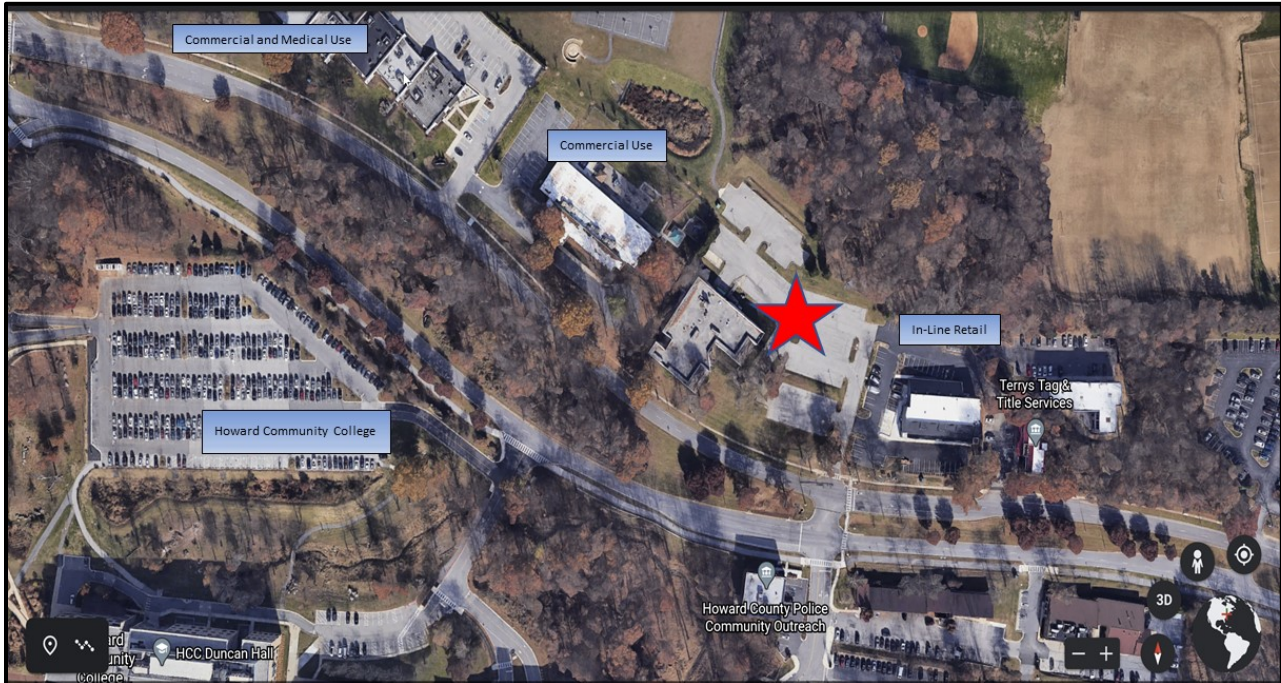
Figure 5: Property Aerial and Surrounding Uses

Retail, commercial, educational, community and health and wellness uses surround the Property.