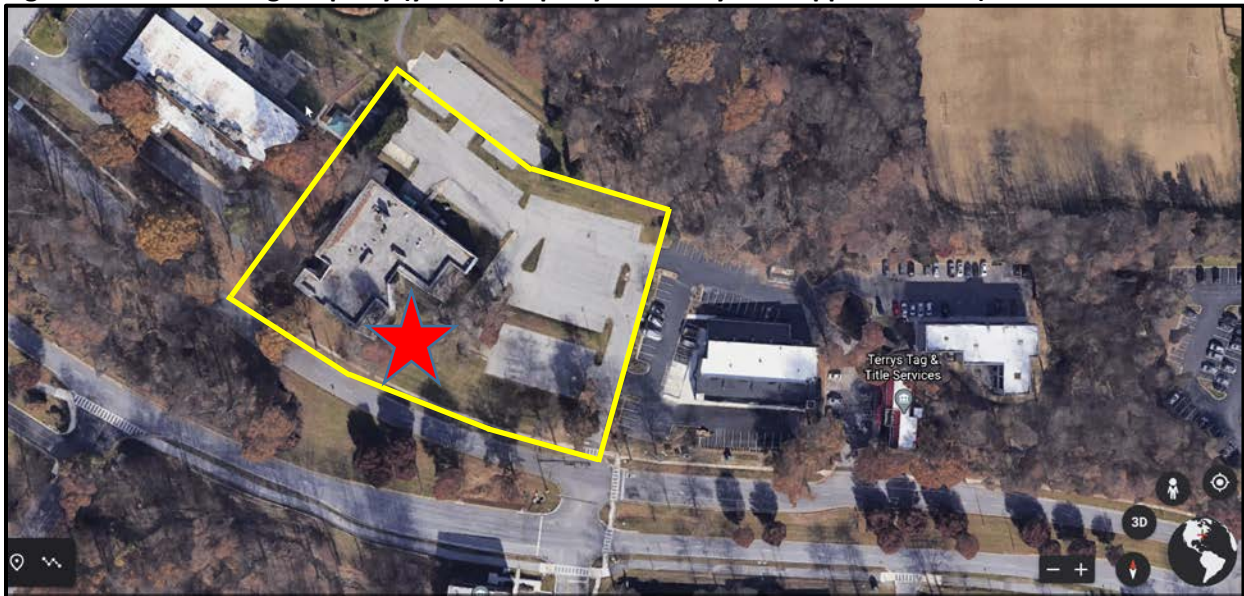
Figure 2: Flier Building Property (yellow property boundary is an approximation)

The Flier Building is situated on an approximate 2.16-acre site which fronts Little Patuxent Parkway, approximately ½ mile west of Downtown Columbia and the Columbia Mall. Entrance into the property is at a signalized traffic light. When exiting the property at the traffic signal, vehicles can make a right hand turn to head west on Little Patuxent Parkway or a left hand turn to head east on Little Patuxent Parkway. Figure 2 shows the property boundary and ingress and egress.