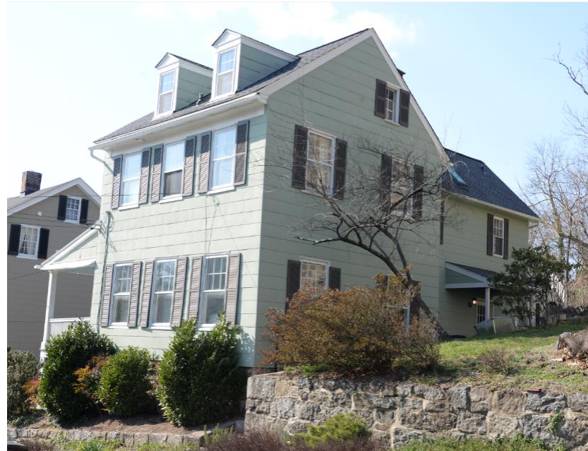
3794 Church Road, Ellicott City