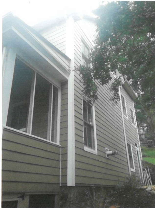
Right Side of House with 1 Side Door