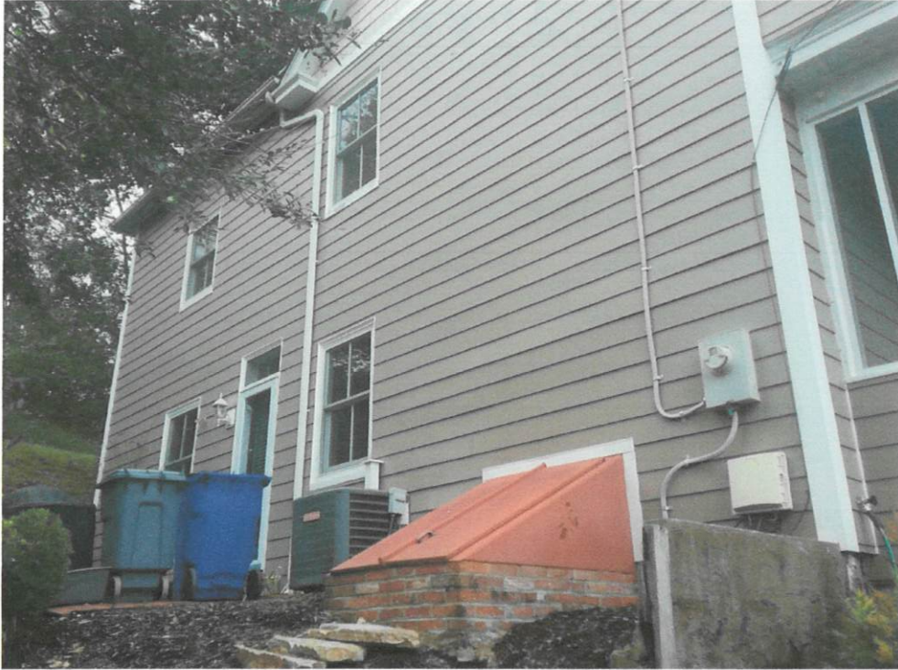
Left Side of House with metal Cellar Door and 1 Side Door