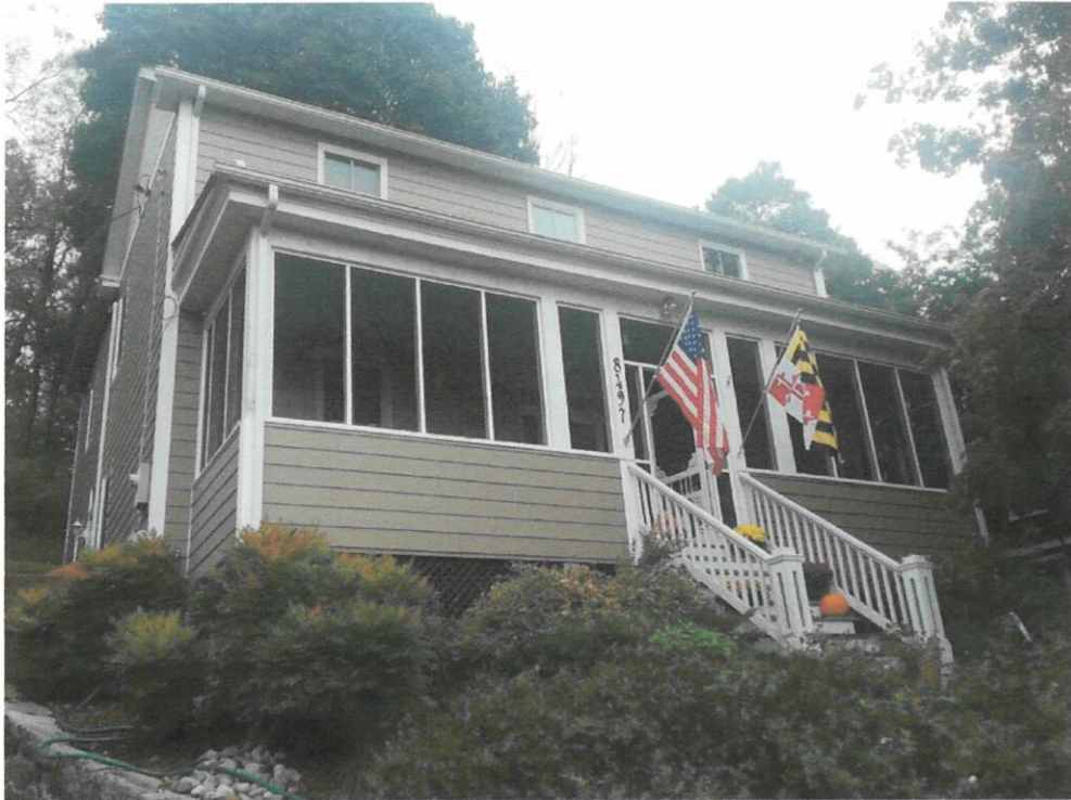
Front of House with Porch, Porch Steps, and Lattice under porch