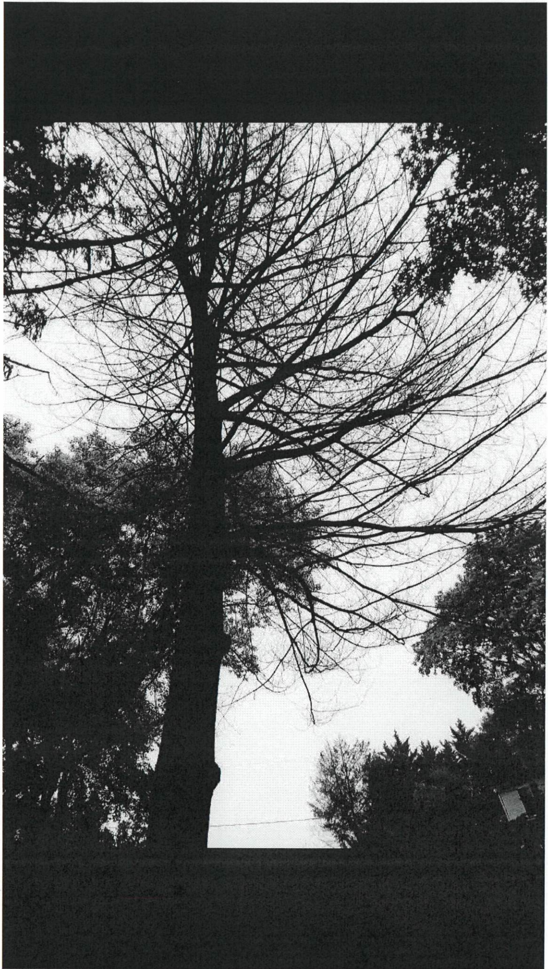
Alad white pine in backyard