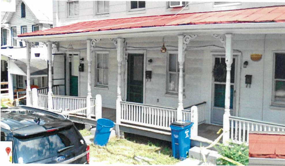
8484-8494 Main Street/Frederick Road -current mix of wood and aluminum storm doors/screen doors