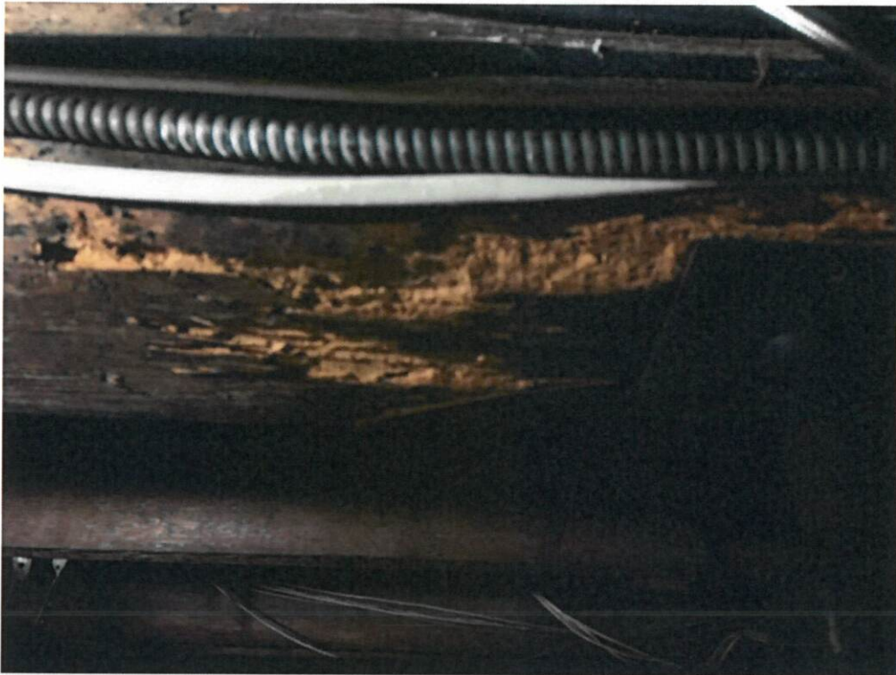
Pic 2: Old termite Damage and new splintering showing progressing collapse. Beam appears to be disintegrating around metal posts