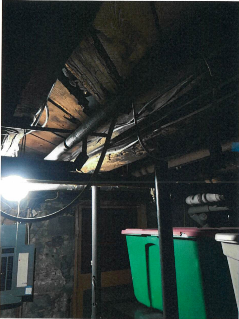
Pic 1: Joists and beams under kitchen and temporary metal posts supporting 6 inch wide damaged beam spanning 20 ft. additional damage is visible on joists in surrounding area but not to same extent.