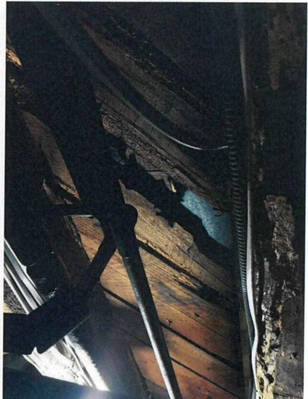
Pic 3 and 4: missing/eaten subfloor and damaged beams under kitchen.