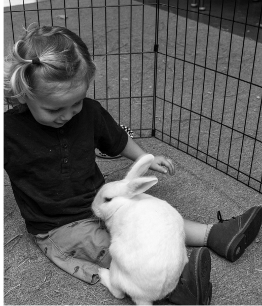
Meet warm & fuzzy creatures up for adoption in our new Home for Warm, Fuzzy and Prickly program.