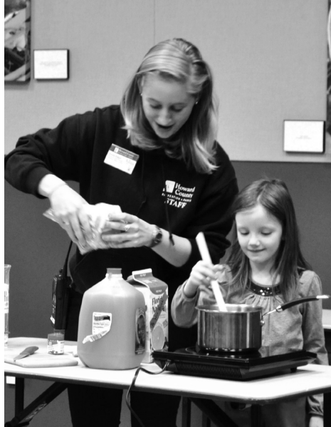
Sip hot cider after a scenic New Year Nature Hike.