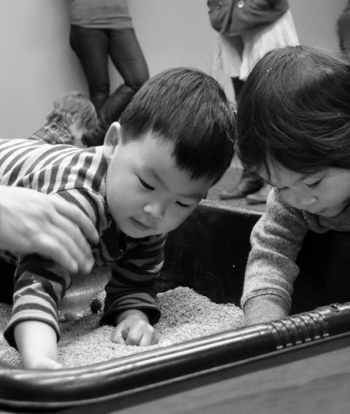
Curious tykes can explore the natural world during Toddler Time.