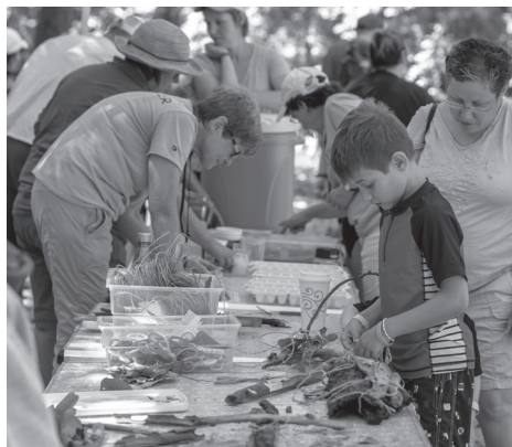
Stay cool at Wild for Water Day.

Parent, guardian or authorized person must sign campers in & out each day and must show a government or school-issued photo identification. Written authorization must be provided if a camper leaves early. Signatures are required (initials not accepted) by a parent, guardian or authorized family friend picking up a child early.