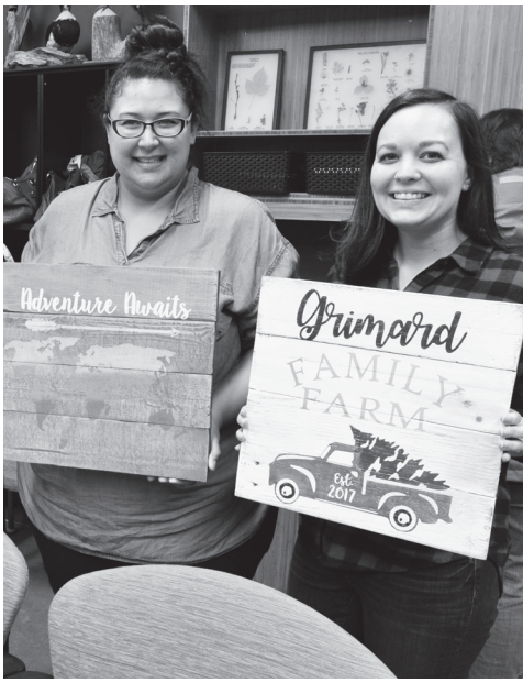
Upcycle into art at Urban Pallet Paint Night.