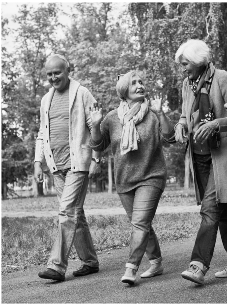
Ease stress at our Peaceful Mind Walk.