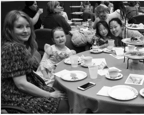
Enjoy tea and snacks at Dapper Duck Tea Party.