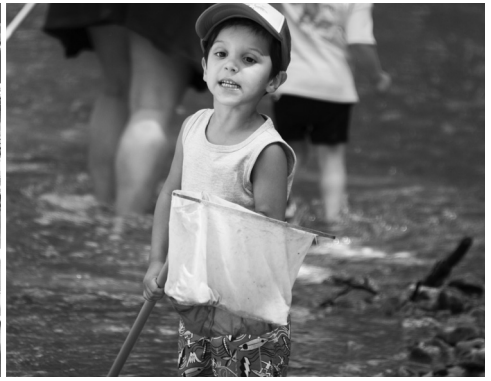
Discover nature through apps at Tech to Trails.