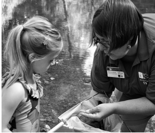
Have a water adventure with River Explorers.