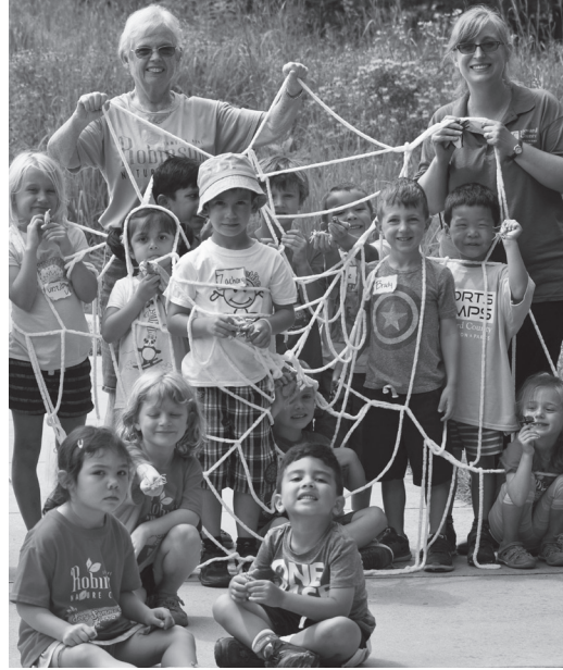
Discover the natural world with Lil' Pine Cones.