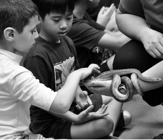
Nature Extravaganza Camp is filled with fun!