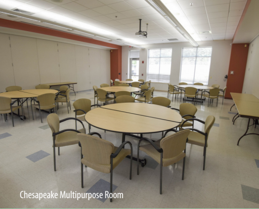
Chesapeake Multipurpose Room