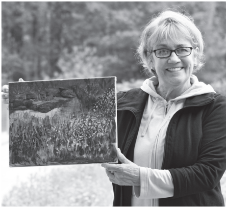
Stroll and Paint