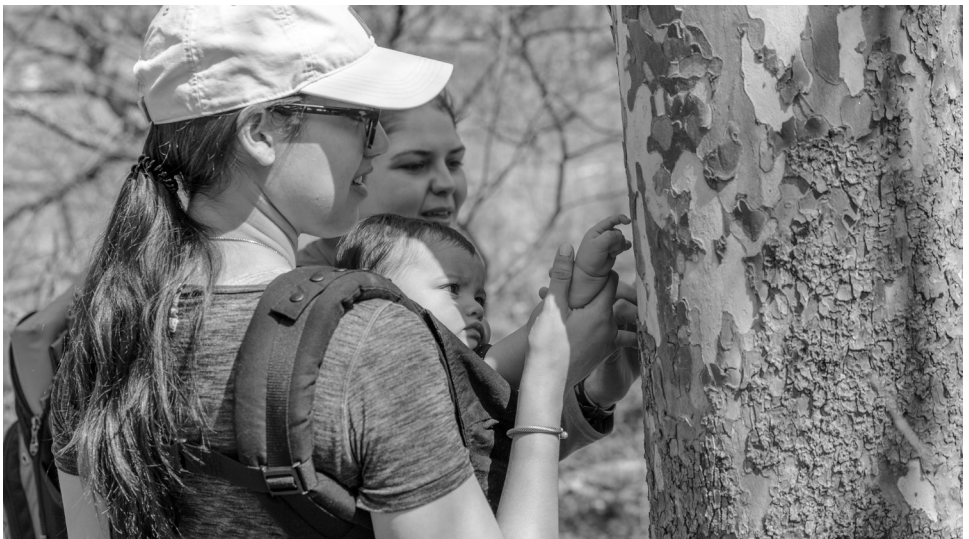
Babes in Backpacks