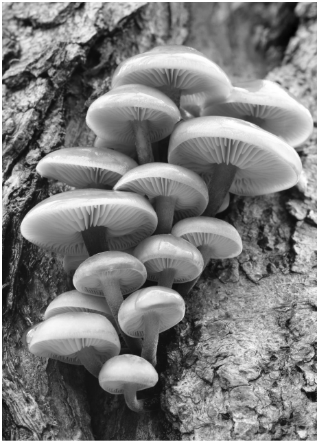
Grow Your Own Mushrooms