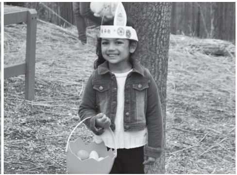
Spring Eggstravaganza for Tots