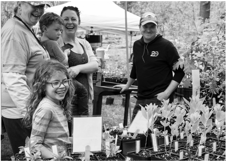
Native Plant Palooza