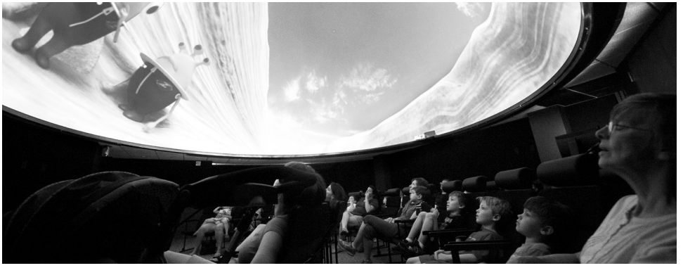
Family Fridays Under the Dome.