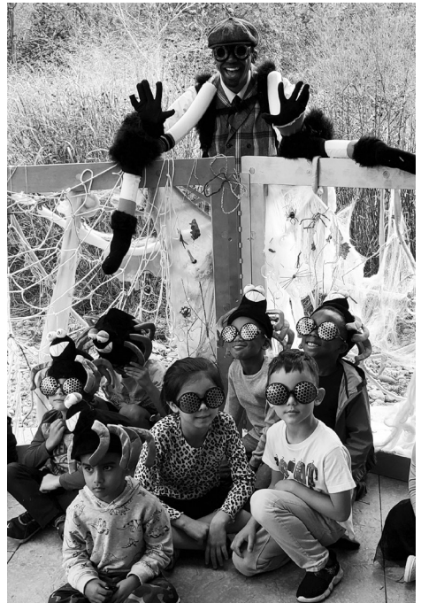
The ART in eARTH