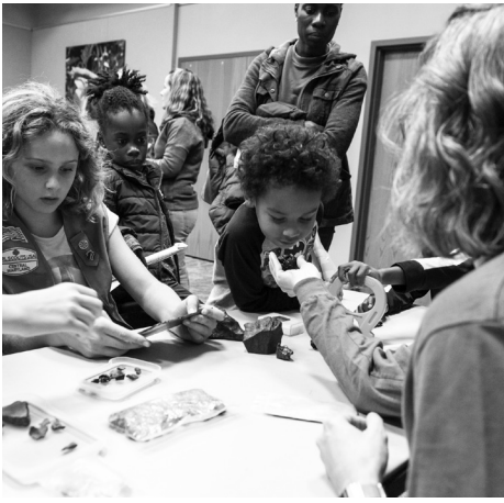
Lil' Stars Astronomy Program

Family Fridays Under the Dome Friday nights with your family should be stellar! Come enjoy unique shows at the Robinson Nature Center's planetarium/dome movie theater. Each program features a full-dome movie preceded by a family-friendly planetarium presentation where you discover what's going on in the night sky each month. See below for show dates, times, featured films and age recommendations.