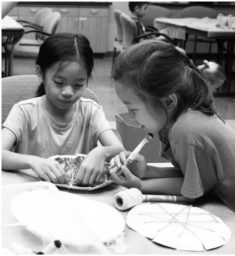
Nature Makers Camp