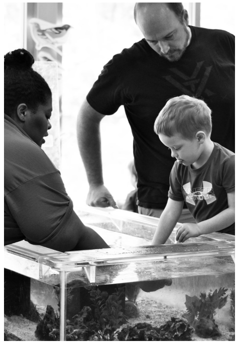
Lil' Acorns Mini-Camp

In-county online registration opens on February 5 at 6pm for Howard County residents. Out-of-county online registration opens February 12 at 6pm.