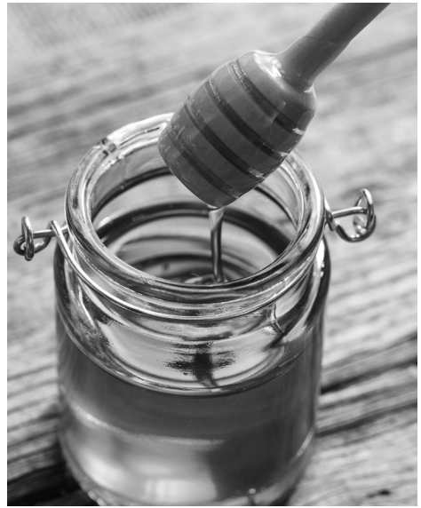
NEW! Pollinator Walk and Local Honey Tasting