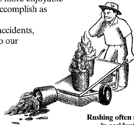
Rushing often results in accidents.