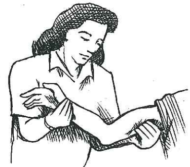
Apply pressure to a nearby artery inside the upper arm.