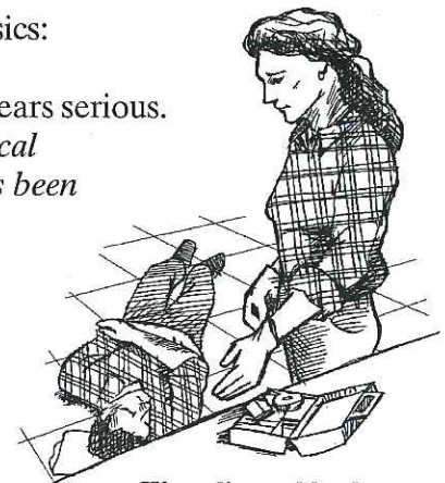
Wear disposable gloves when administering first aid.