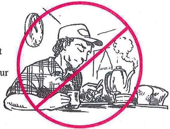
Don't overeat or drink a lot of coffee before bed.

Note to trainer: Tell trainees who else they may contact, such as a human resources manager or employee assistance personnel, for problems that may be interfering with their sleep.