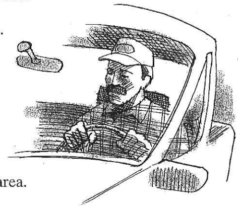
Always keep your hands on the wheel and your eyes on the road ahead when you are driving.