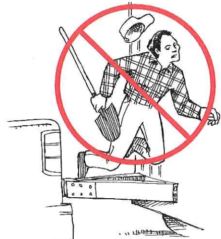
Hurrying results in accidents.