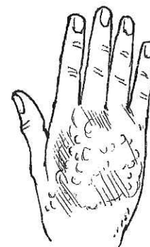
Keeping your hands clean reduces the chance of skin rashes.