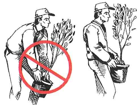
Don't bend from the waist when picking up an object.