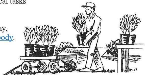
Always use the correct posture when carrying objects.